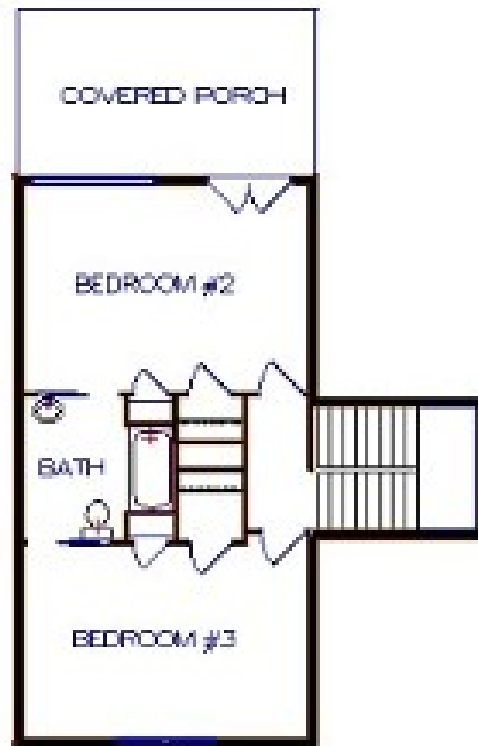
2ND FLOOR LAYOUT 616 s.f.